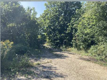
Area of hardstanding has a very disturbed character but has potential to be repurposed.