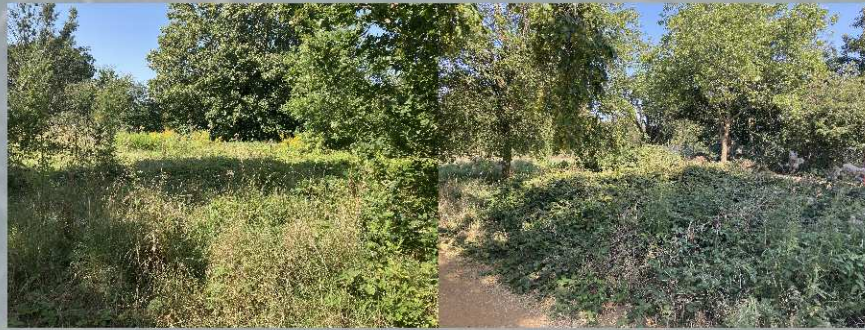
Woodland areas within the Site differentiate it from the rest of Hanworth Park and provide enclosure within the Site.