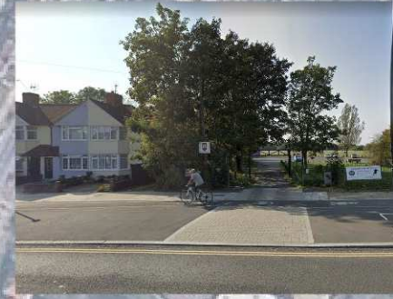
Existing Site access to the north off Hounslow Road (A314). Hounslow Football Club / Eddie's Bar with surfaced car park for approx. 40-50 cars