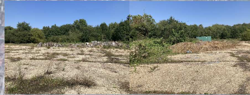
Areas of existing hardstanding have brownfield quality, but retain a good sense of enclosure by virtue of surrounding woodland. The hardstanding measures approx. 0.78ha