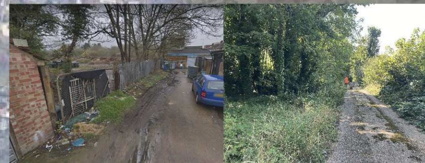
Existing Site access points off Park Road. Surfaced track leads from the southern entrances to the existing hardstanding areas.