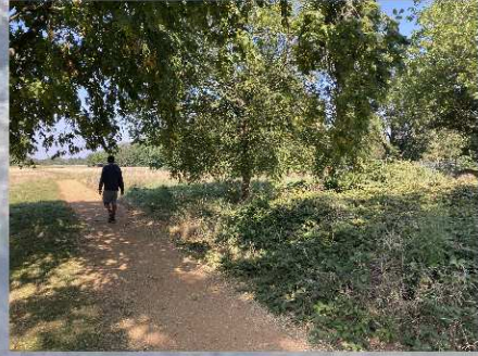
Existing path along the west perimeter of the Site provides good connectivity to the wider park.