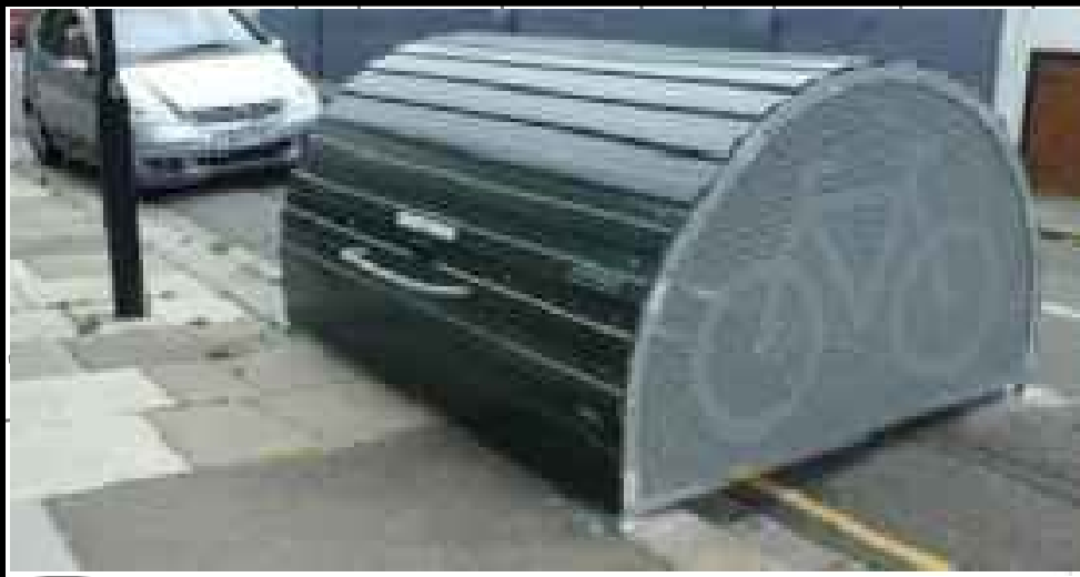
Example of a Bike Hangar