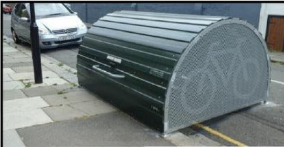
Example of a bike hangar facility