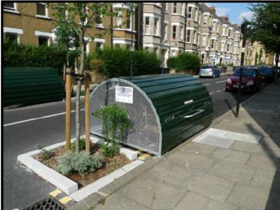
Example of a bikehangar facility